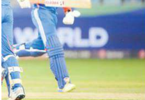
run between the wickets during the Asia Cup 2025 match between India & September 26, 2025.